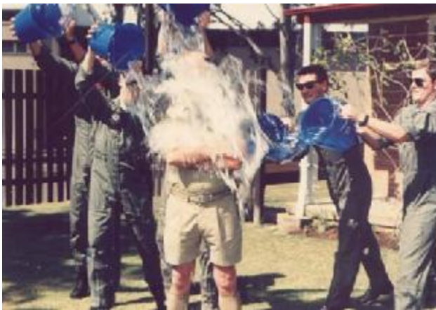
Farewell from 6 Squadron washdown and presentation 1989.