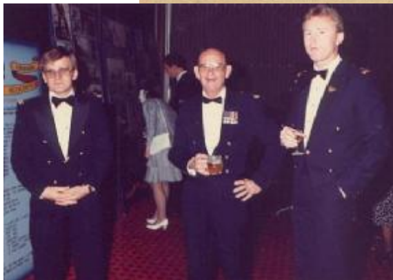
12 Squadron disbandment dining out 1989