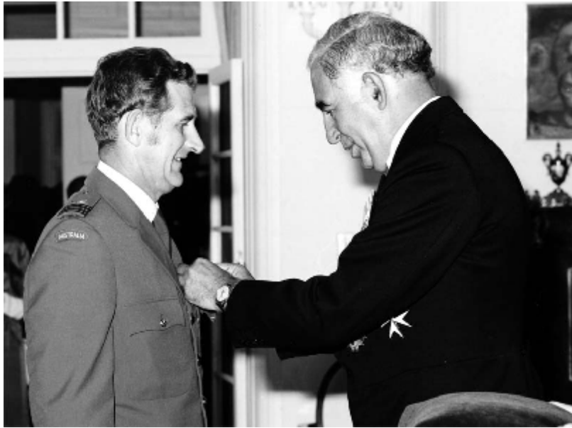
Presentation of Air Force Cross at Government House, Canberra 1979 by Governor-general, Sir Zelman Cowan.