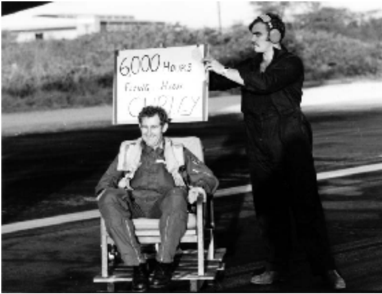
6000 flying hours. At Barbers Point, Hawaii 1977.