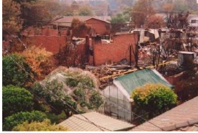
Fire damage photo from roof of my Duffy house, January 2003